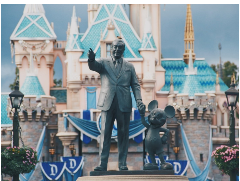
Figure 1. Disneyland Resort