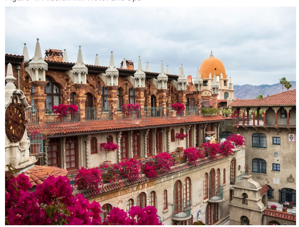
Figure 4. Mission Inn Hotel and Spa