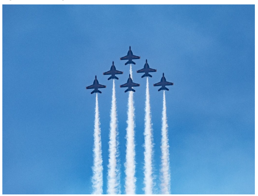
Figure 8. Blue Angels at NAF El Centro