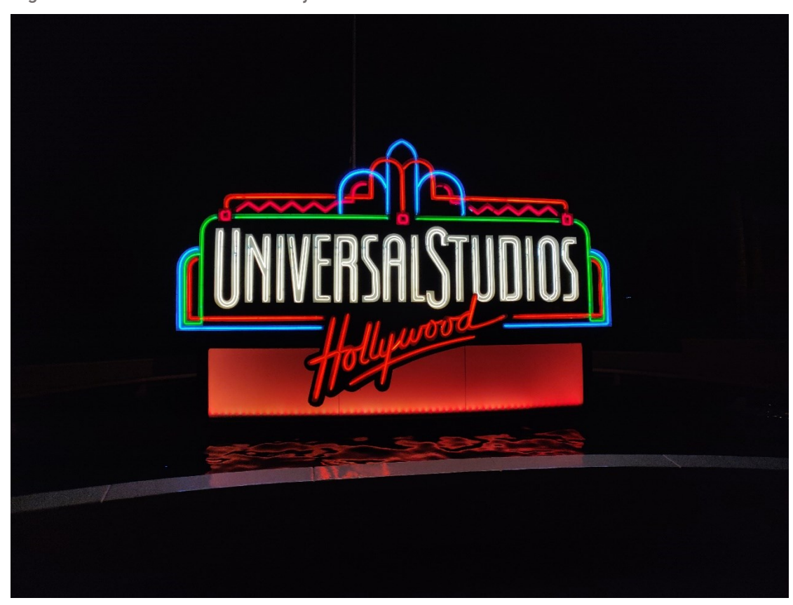
Figure 5. Universal Studios Hollywood