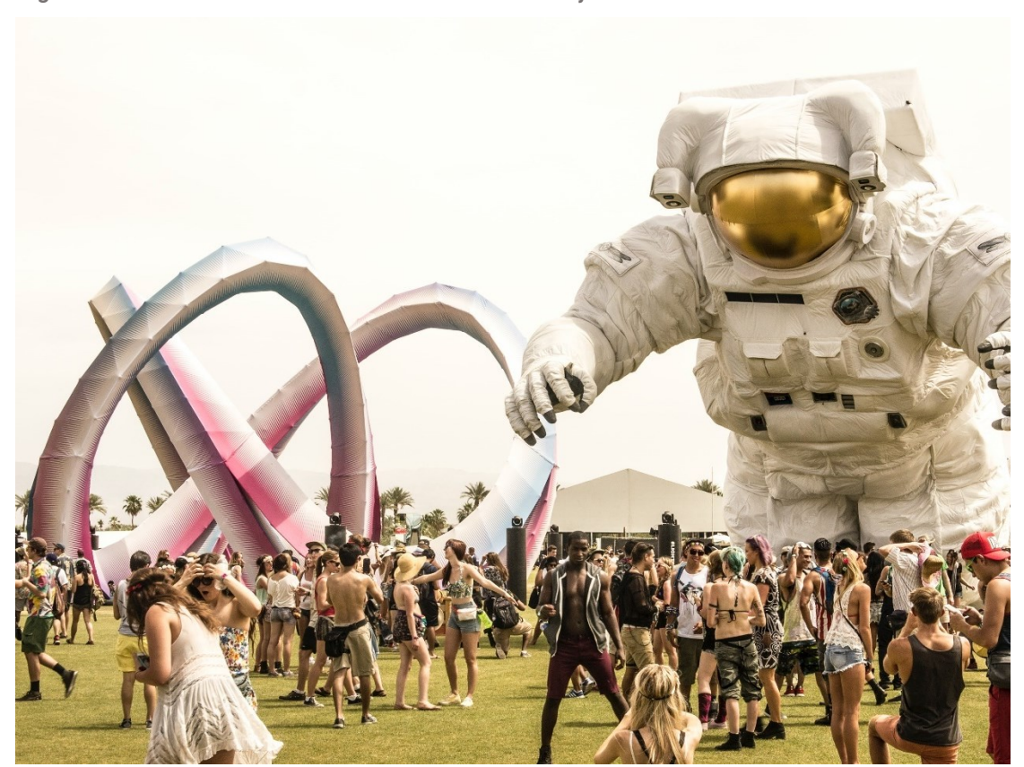
Figure 9. Art Installations at the Coachella Valley Music and Arts Festival