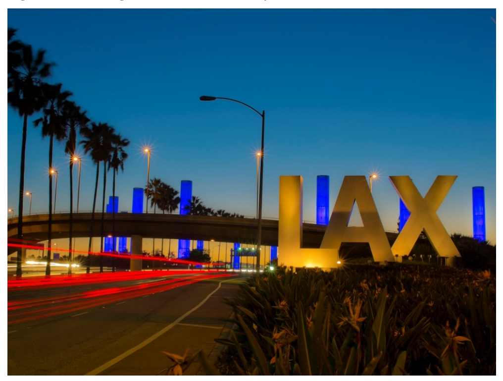
Figure 10. Los Angeles International Airport