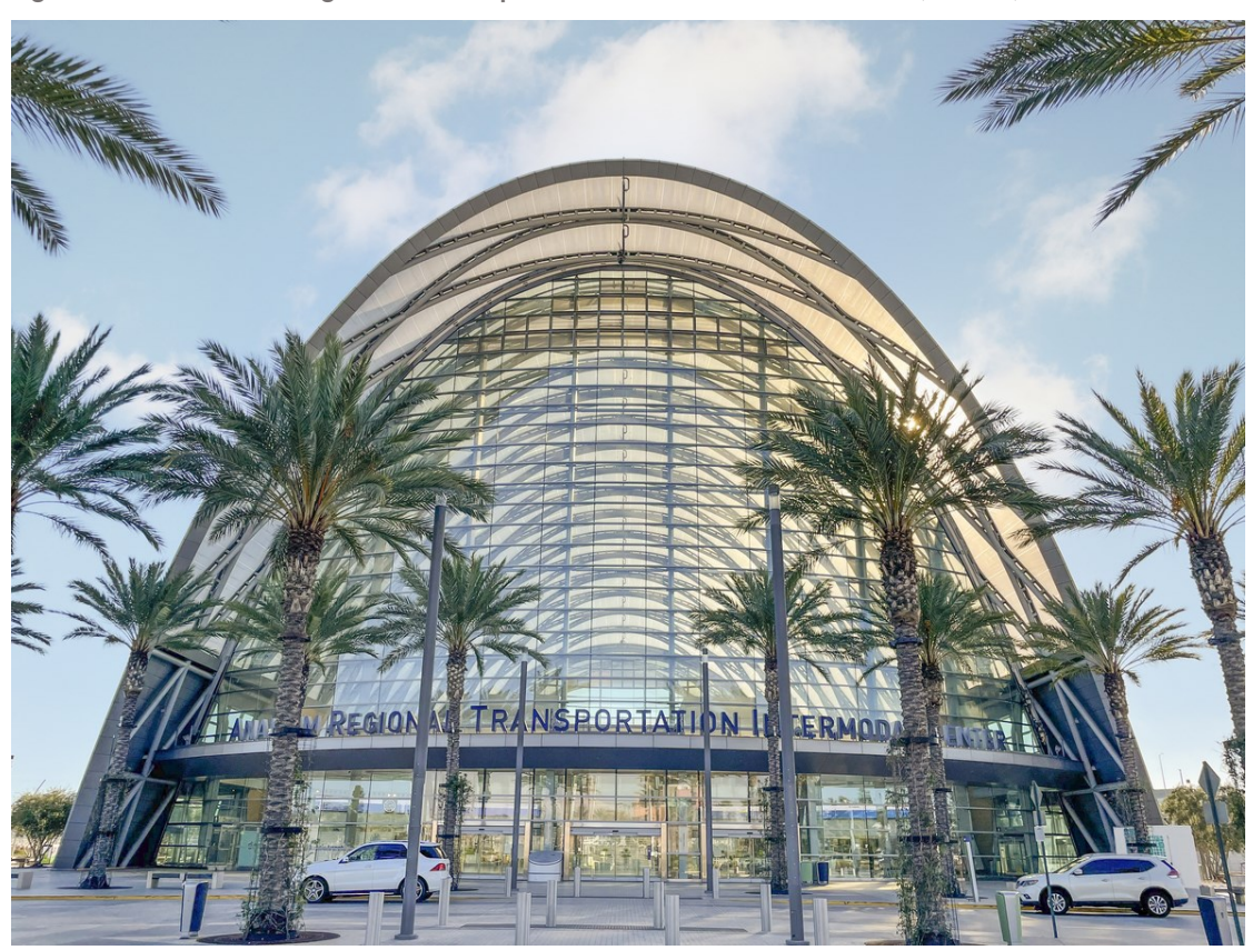
Figure 11. Anaheim Regional Transportation Intermodal Center (ARTIC)

In addition to being stops for the Amtrak and Metrolink passenger rail systems, and transit networks throughout the region, many of the train and intermodal stations in the SCAG region are also tourist attractions, whether due to their designations as historic landmarks, interesting design, or locations in city centers. The following are just some of the notable rail stations in the region: