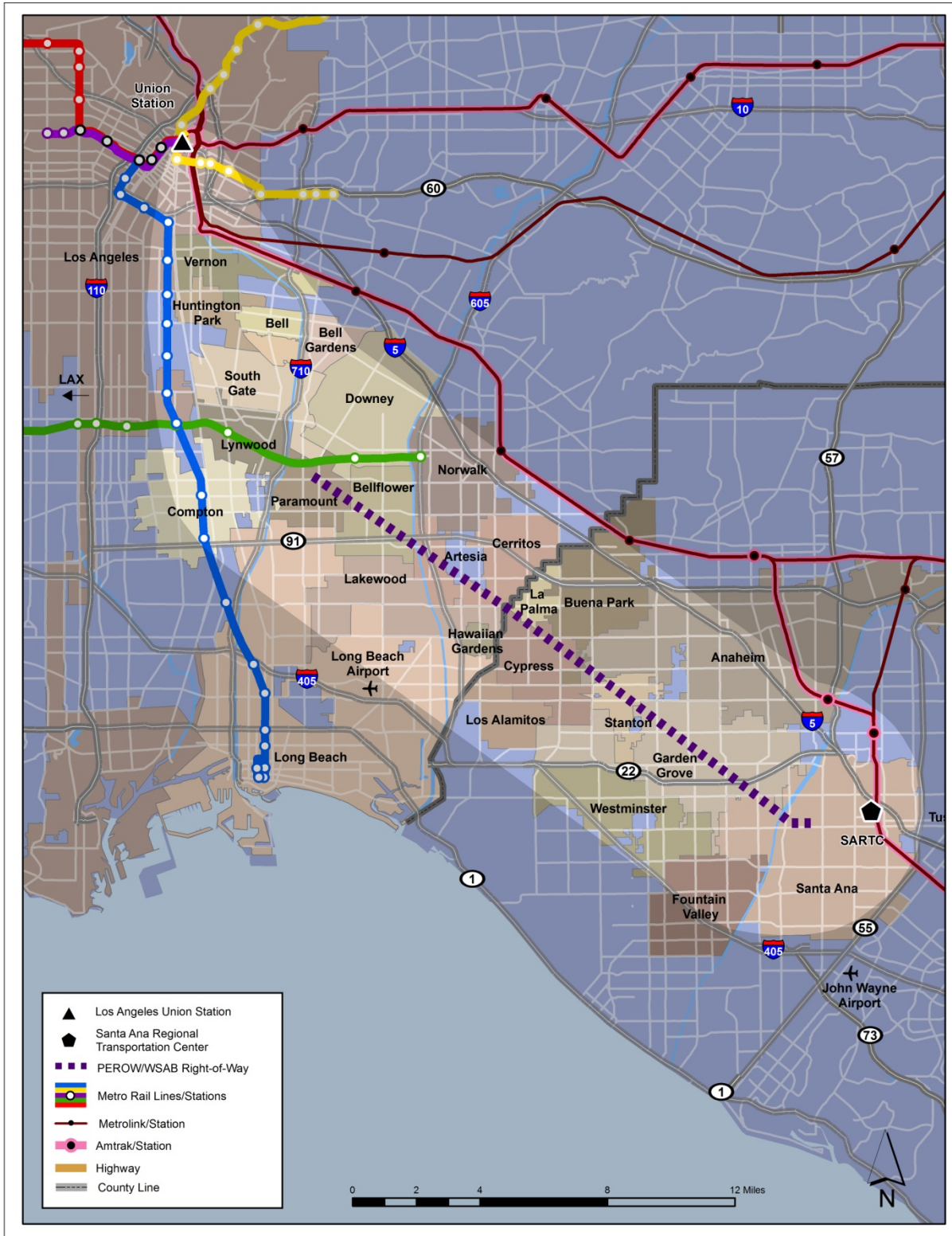
Figure 1.3 – Corridor Transportation System